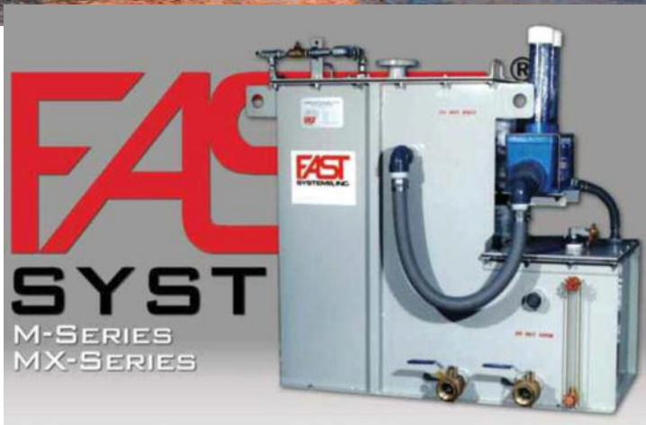
Featured above is an MX-2 Series FAST® Unit.