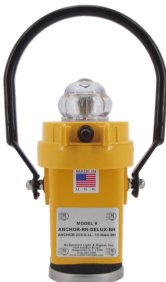
ANCHOR-RR-DELUX-BH Bail Handle Option

Certified by a U.S. Coast Guard Accepted Lab to meet applicable sections of UL1104