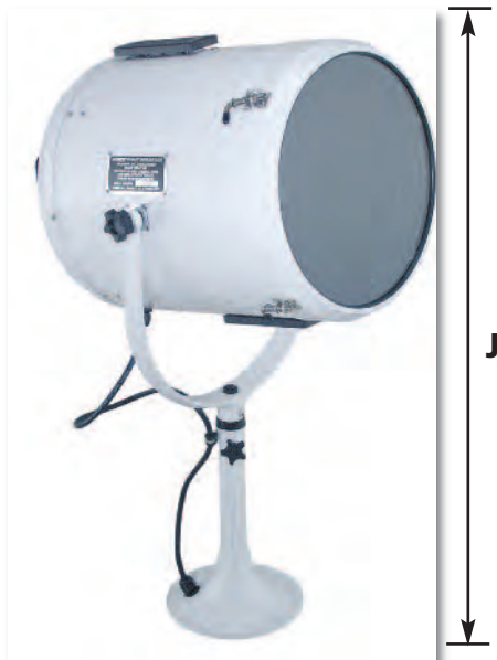
Fig. 0883 - Medium Pedestal White