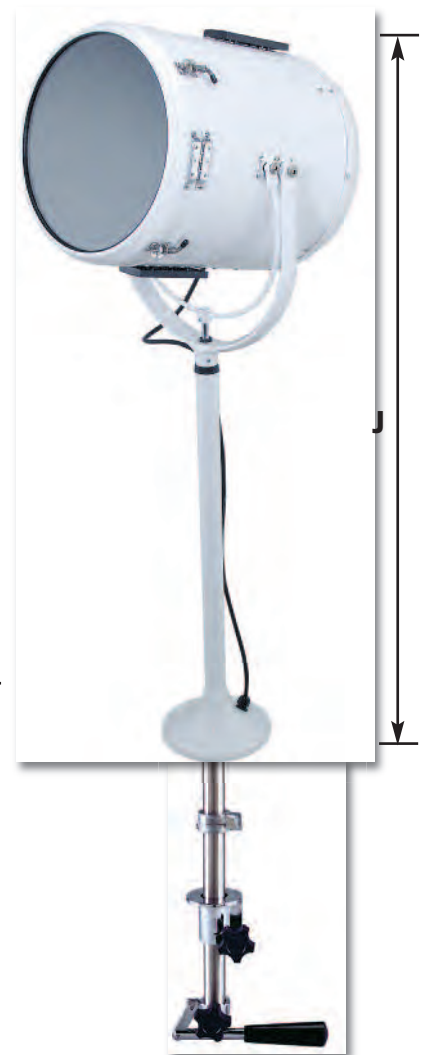
Fig. 0884 High Pedestal White