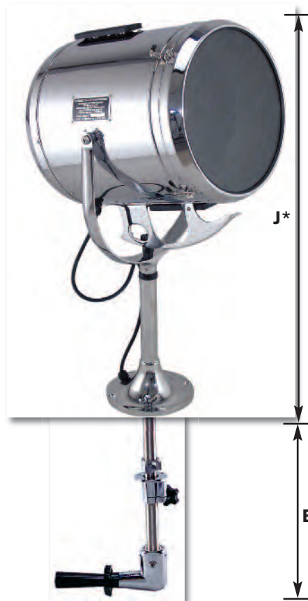
Fig. 0885 Chrome Medium Pedestal Shown With Lever/Gear Control