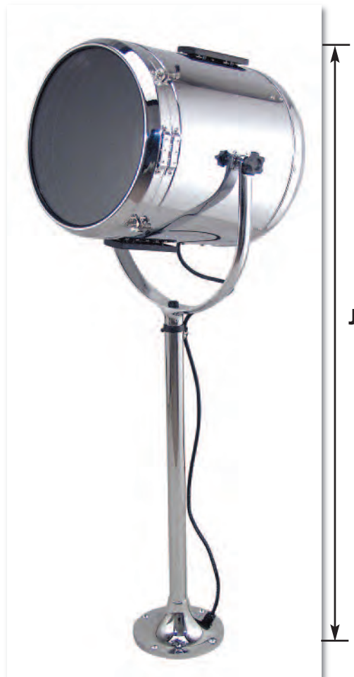
Fig. 0883 - High Pedestal Chrome