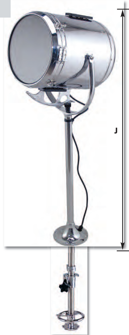
Fig. 0885 Chrome High Pedestal Shown With Wheel Control