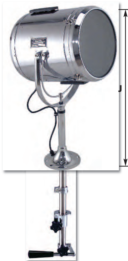
Fig. 0884 Medium Pedestal Chrome