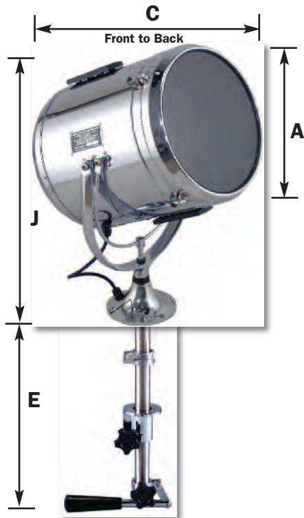
Fig. 0884 Standard Pedestal Chrome