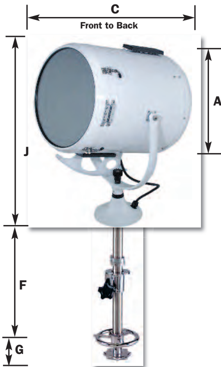
Fig. 0885 White Standard Pedestal Shown With Wheel Control