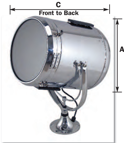
Fig. 0883 - Standard Pedestal Chrome